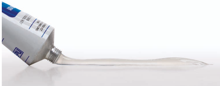
TABLE 2: Cure rate vs. temperature for addition cure adhesive systems.